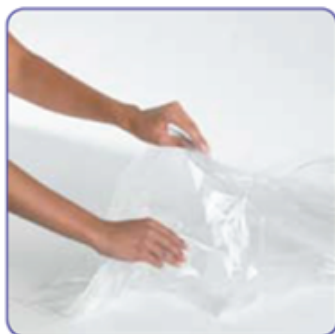
1. While bags are still empty place one inside another.

To ensure a tight seal, please follow these instructions carefully: