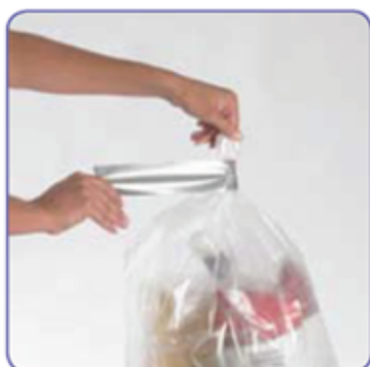
4. Repeat Step 3 with the outer bag.