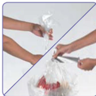
3. Twist the top of the inner bag, fold once and secure the fold in place using tape or a twist tie.