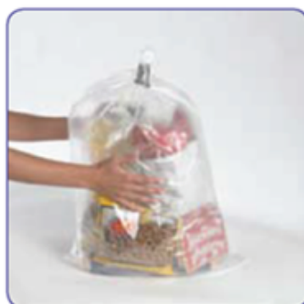
5. Check the seal by pressing gently against the sides of the bag and listening for air leaks. No air should be able to escape.